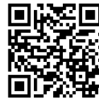
WHA FACEBOOK PAGE