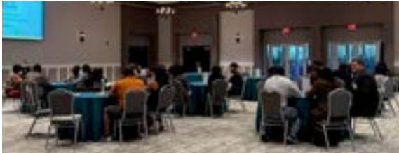
Pictured Above: Housing Developers Networking