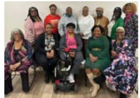
Pictured Above: Wellness Checker Callers, WHA Resident Services Team & WHA Security