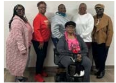
Pictured Above: Wellness Checker Volunteer Callers

For more information on Wellness Checker Program, call 302-761-9460 ext. 101.