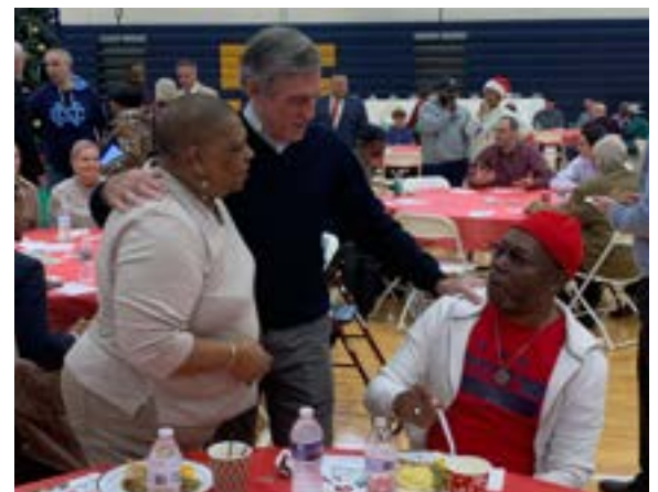
Pictured Above: Governor Carney & WHA Residents