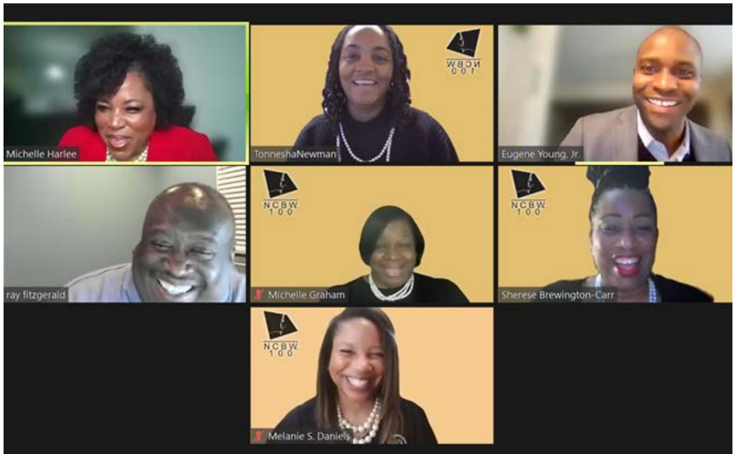
Pictured Above: NCBW President, Forum Moderator and Panelists.

For more information on WHA's programming, visit https://whadelaware.org/about-wha . Specific questions regarding WHA housing locator services call 302-429-6701 or email dehgresource@whadelaware.org .